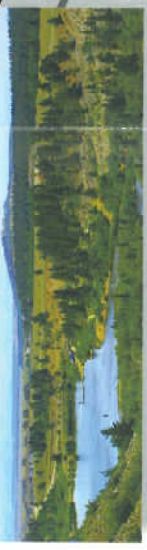
Award-Winning Fairplay Beach.