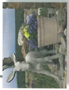
Puritas Monument on Historic Front Street