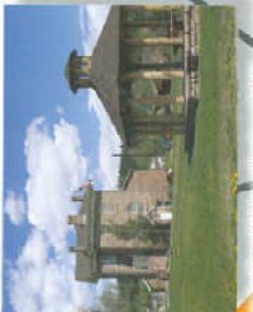
Fairplay Old County Courthouse (1374)