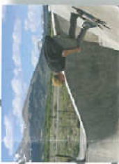
Scale Park at the South Park Recreation Center