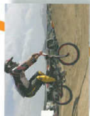
ABA BMX Track at the South Park Recreation Center