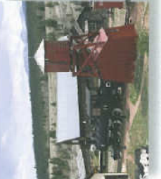
South Park City Museum