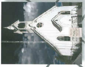
South Park Community Church, 1874