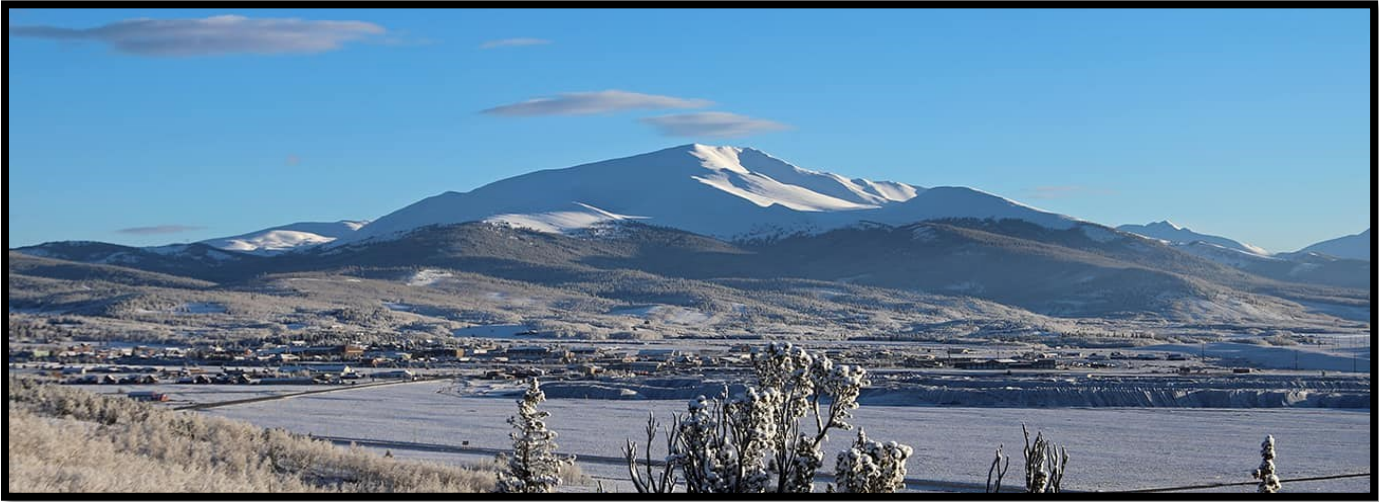
Winter is coming

TOWN OF FAIRPLAY MISSION STATEMENT -Recognizing our unique heritage and environment, the Town of Fairplay is committed to accountable leadership in order to protect and enhance our citizens' quality of life by ensuring the delivery of effective and efficient public services. We implement this mission based on the following core values: open communication; transparency; integrity; professionalism and teamwork.