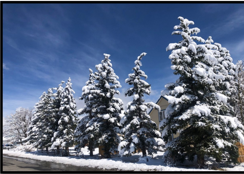
Springtime in Fairplay