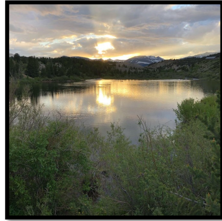
Summer is on the way

TOWN OF FAIRPLAY MISSION STATEMENT -Recognizing our unique heritage and environment, the Town of Fairplay is committed to accountable leadership in order to protect and enhance our citizens' quality of life by ensuring the delivery of effective and efficient public services. We implement this mission based on the following core values: open communication; transparency; integrity; professionalism and teamwork.