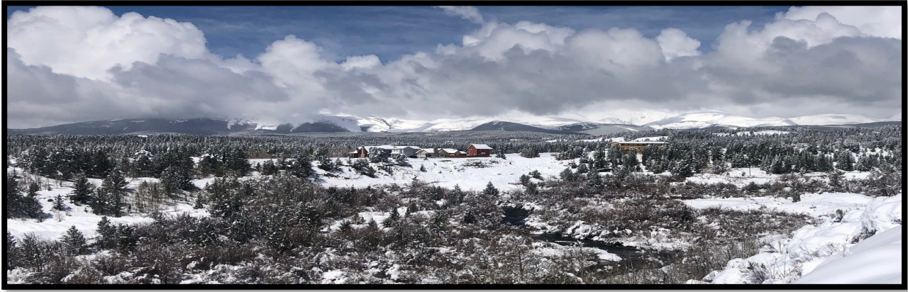
Winter Beauty on the Middle Fork of the South Platte River in Fairplay

TOWN OF FAIRPLAY MISSION STATEMENT -Recognizing our unique heritage and environment, the Town of Fairplay is committed to accountable leadership in order to protect and enhance our citizens' quality of life by ensuring the delivery of effective and efficient public services. We implement this mission based on the following core values: open communication; transparency; integrity; professionalism and teamwork.